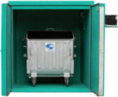
Storage capacity: 1 single steel container, 1100 litres