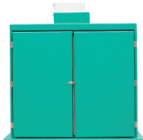
Cadaver cell type 3 with top cooler