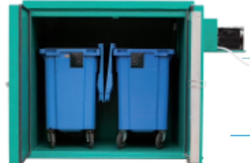
Storage capacity: 2 containers, 770 litres each