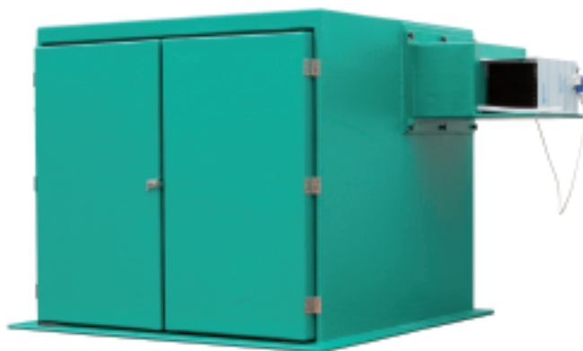
Cadaver cell type 2 with wall cooler